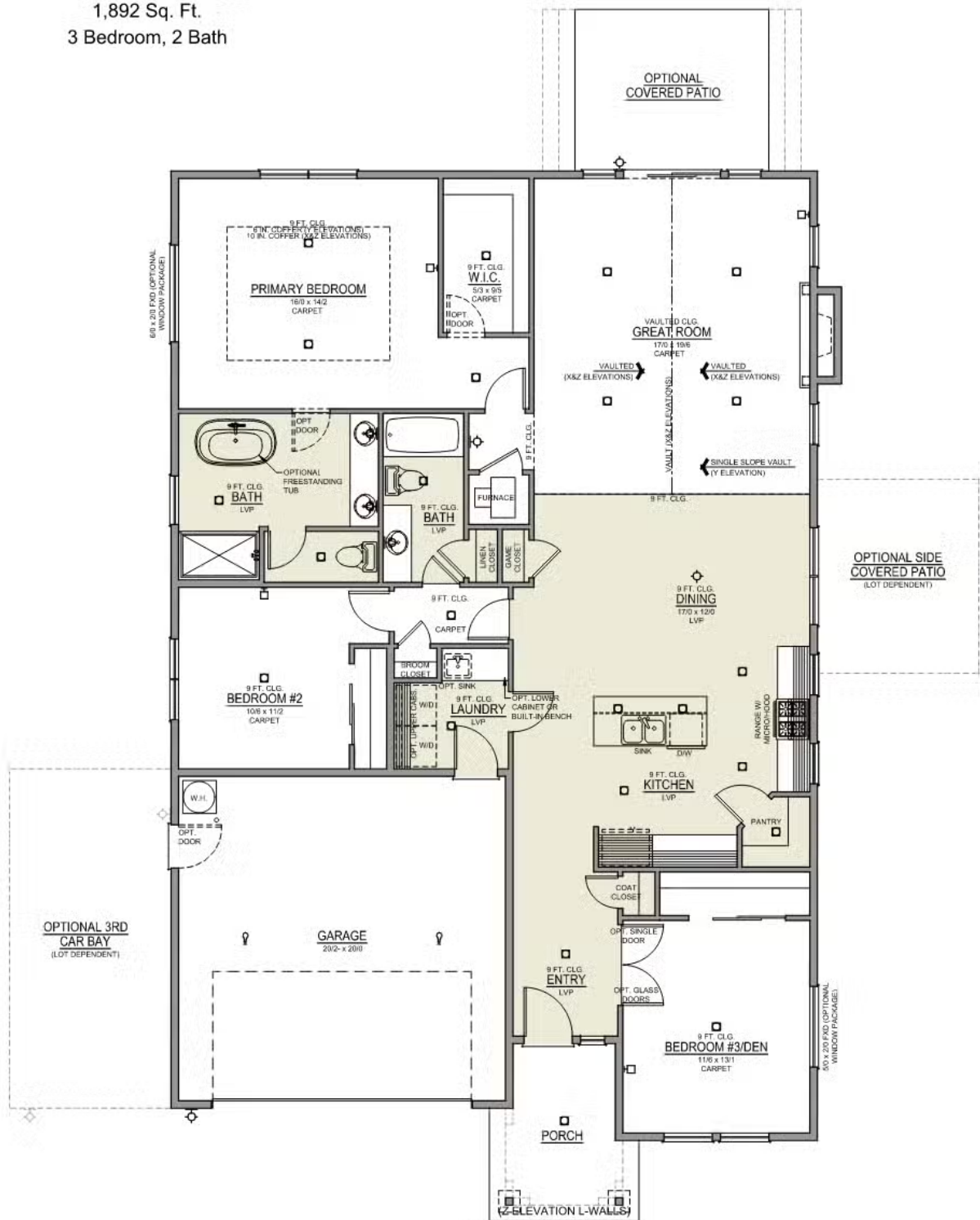
Charity 2-Car 1,892 Sq. Ft. 3 Bedroom, 2 Bath