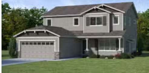
V - Farmhouse, 2 Car