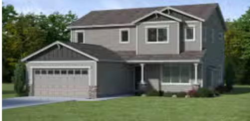
U - Craftsman, 2 Car