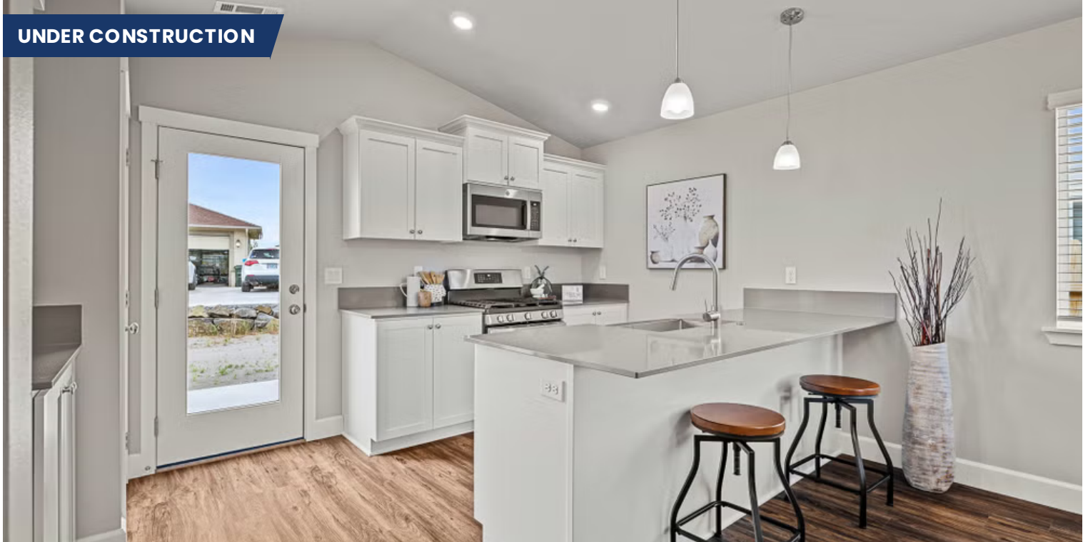
U - Craftsman