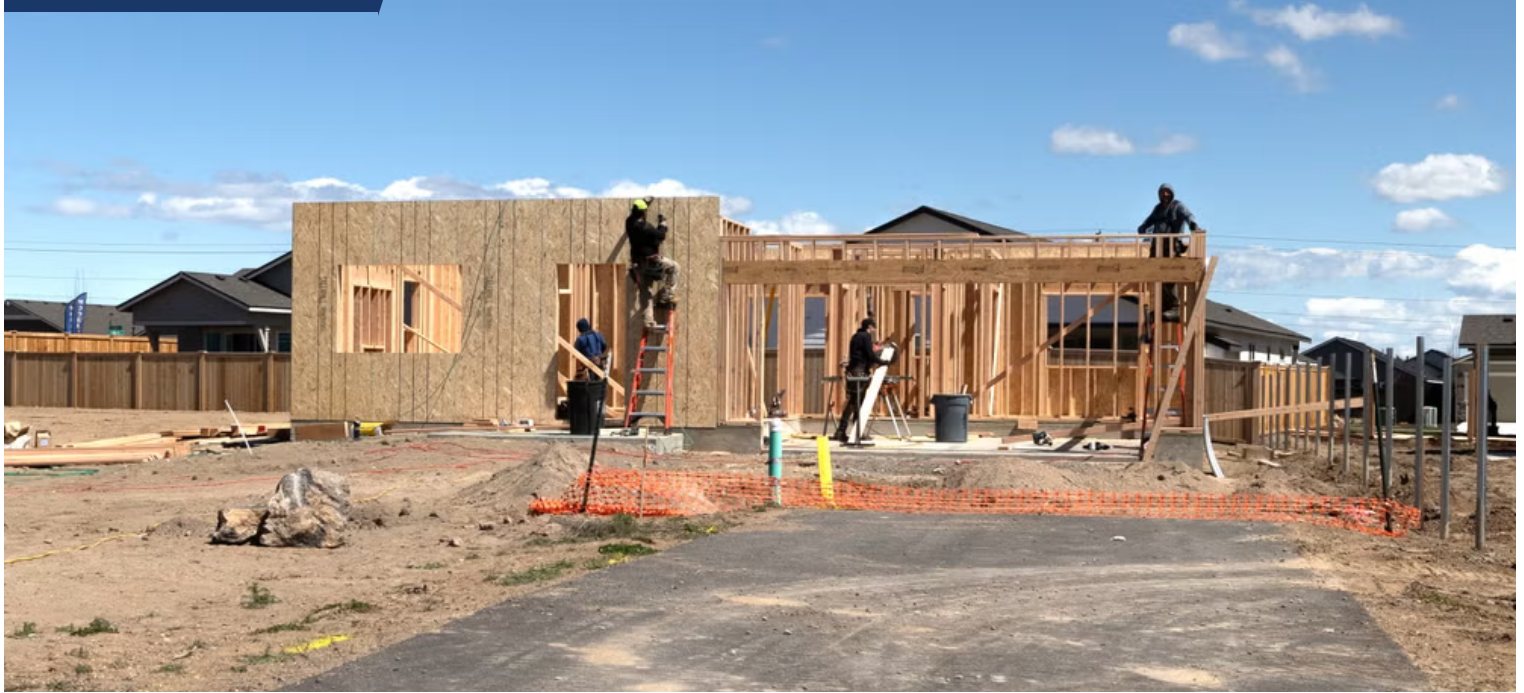
T - Traditional