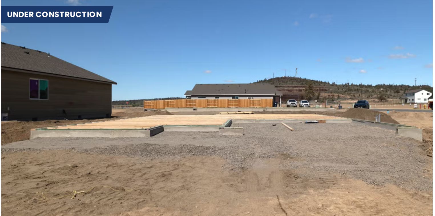
V - Farmhouse, 2 Car