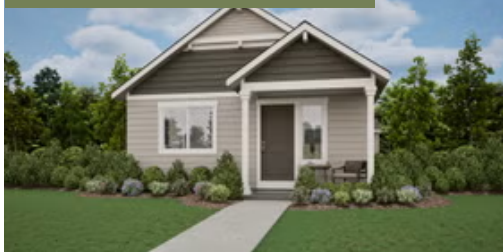
K - CRAFTSMAN ELEVATION