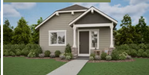
L - FARMHOUSE ELEVATION