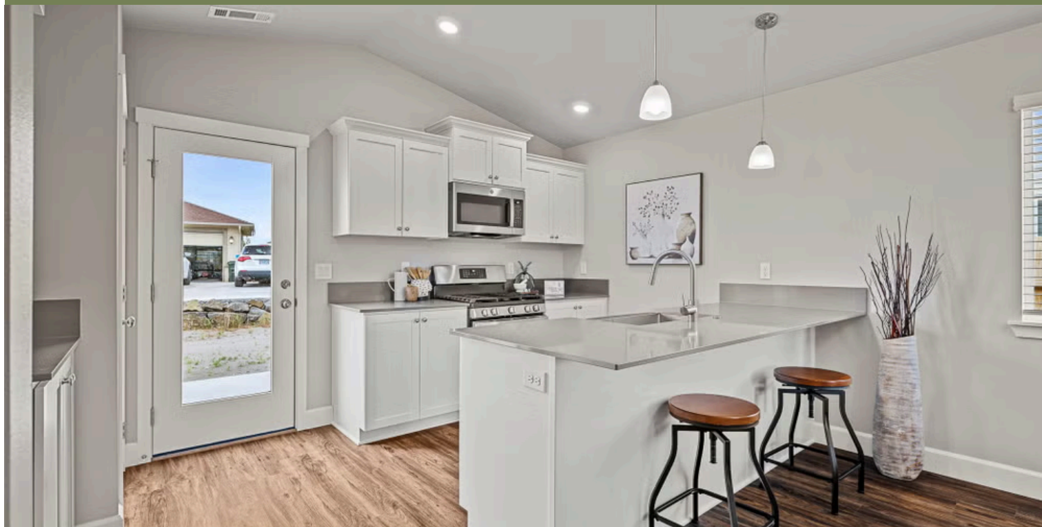
U - CRAFTSMAN