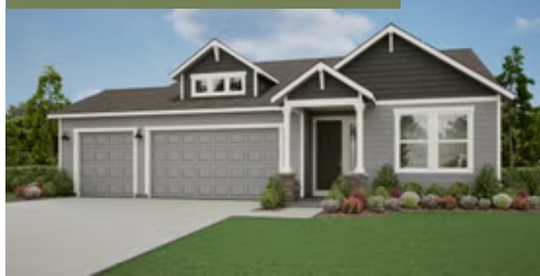
Y - MODERN ELEVATION