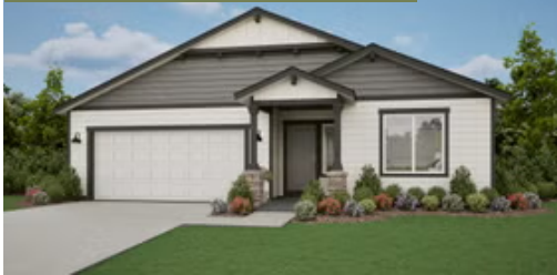
U - CRAFTSMAN ELEVATION