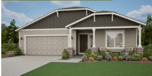
V - FARMHOUSE ELEVATION