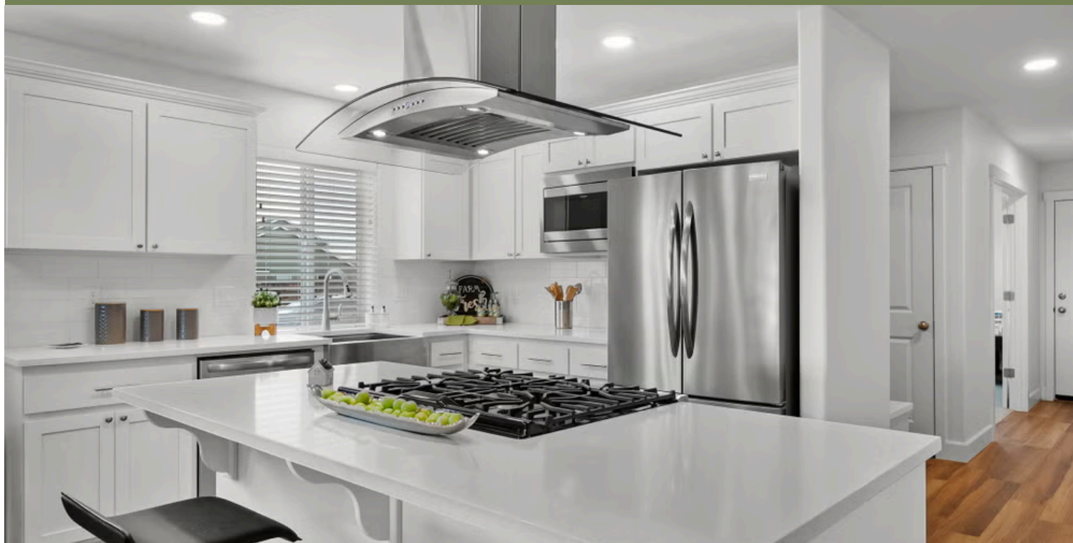
X - CRAFTSMEN