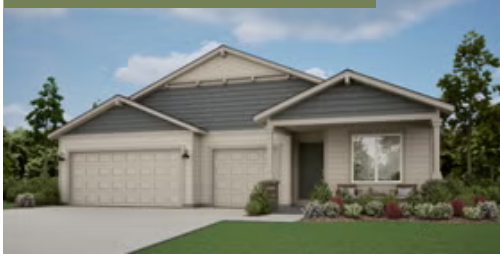
U - CRAFTSMAN ELEVATION