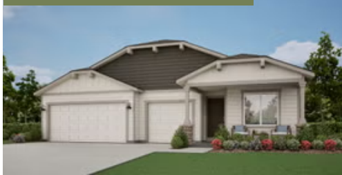
V - FARMHOUSE ELEVATION