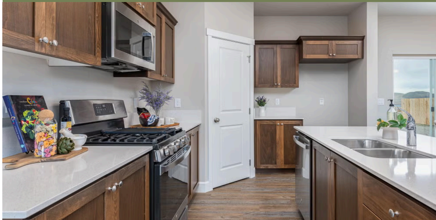
T - TRADITIONAL