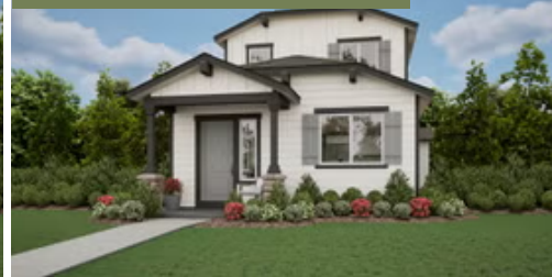
L - FARMHOUSE ELEVATION