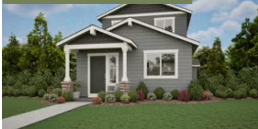
K - CRAFTSMAN ELEVATION