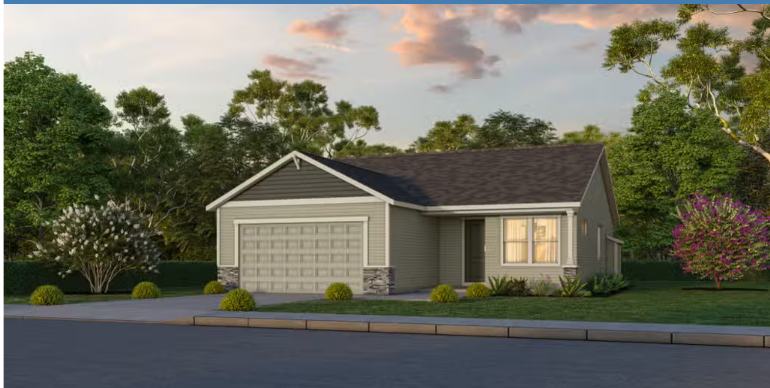
X - Craftsmen