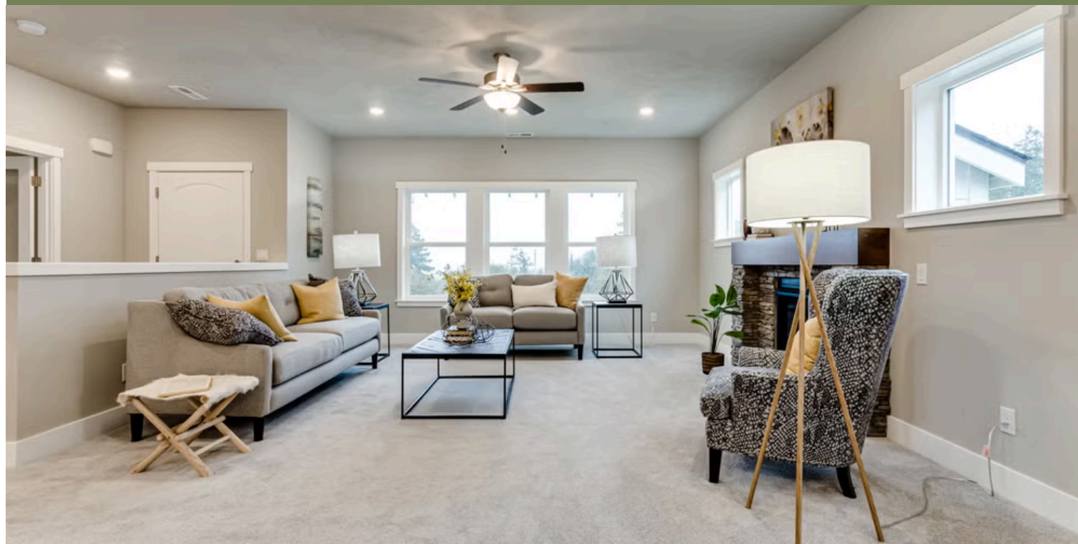
X - CRAFTSMEN