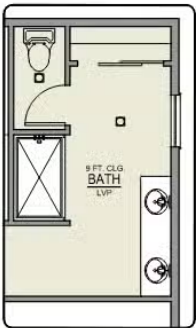
PRIMARY BATH CLOSET OPTION

Miranda 2-Car 2,517 Sq. Ft. 4 Bedroom, 3 Bath