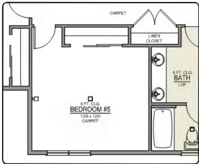
BEDROOM #5 OPTION