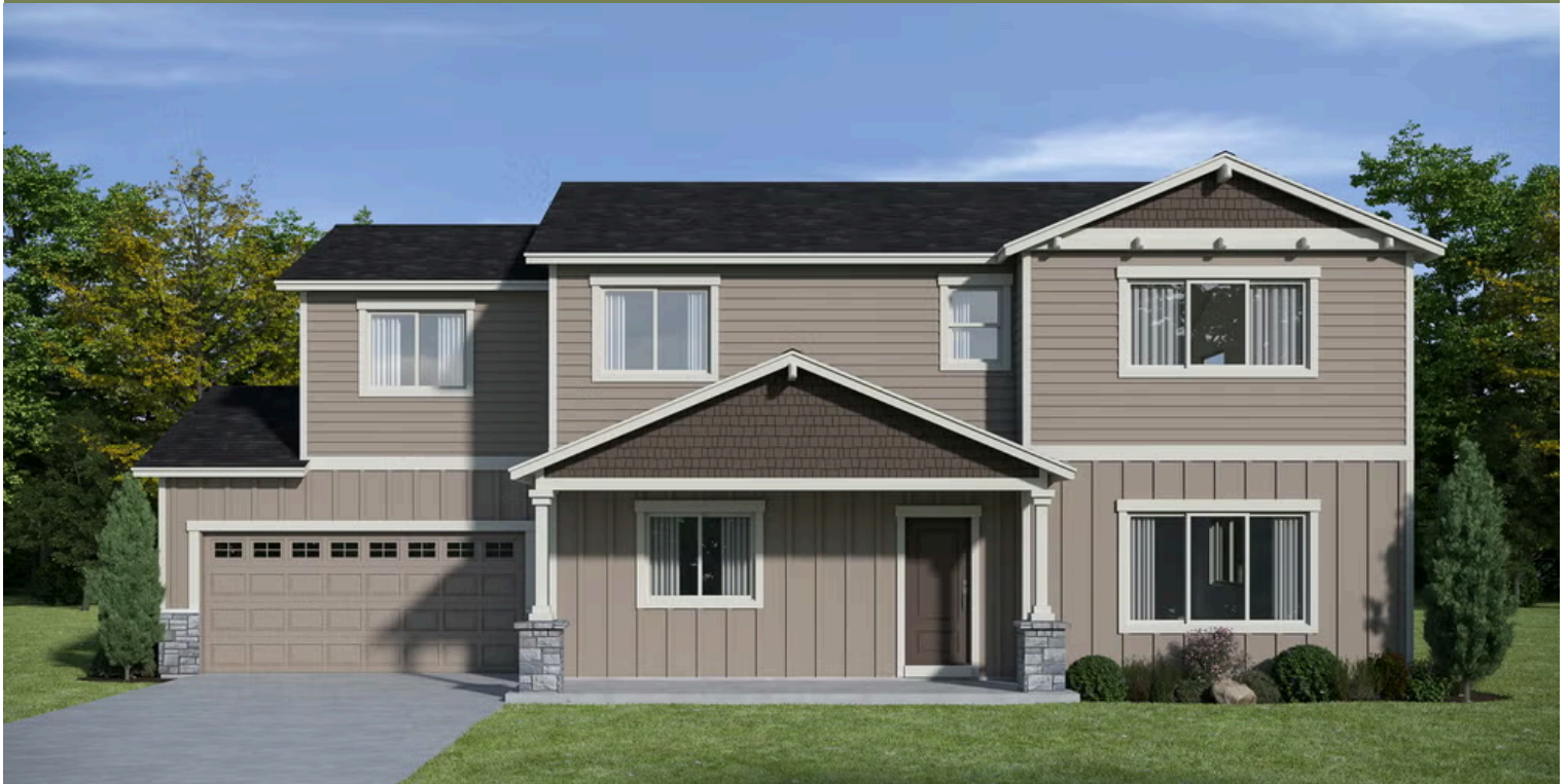
T - TRADITIONAL