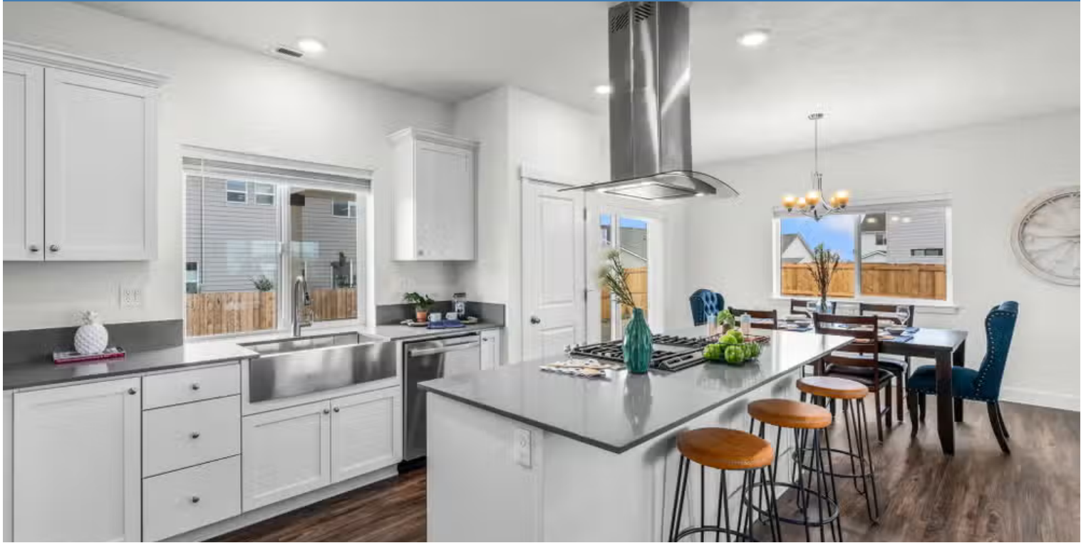
T - Traditional