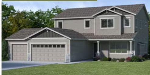
U - CRAFTSMAN, 3 CAR