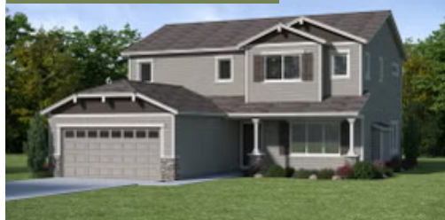
T - TRADITIONAL, 3 CAR