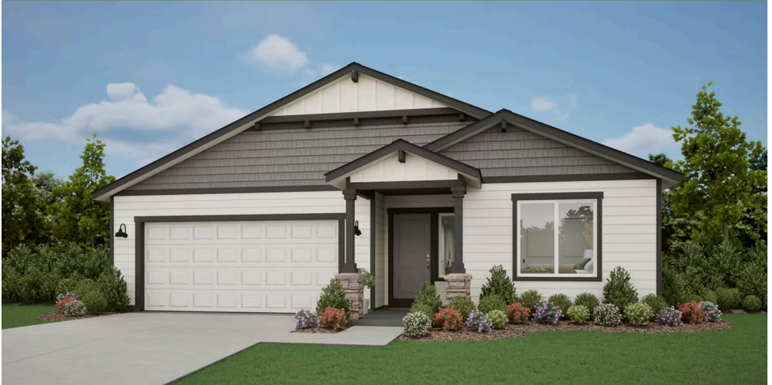
T - TRADITIONAL ELEVATION