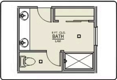
PRIMARY BATH LINEN CLOSET OPTION