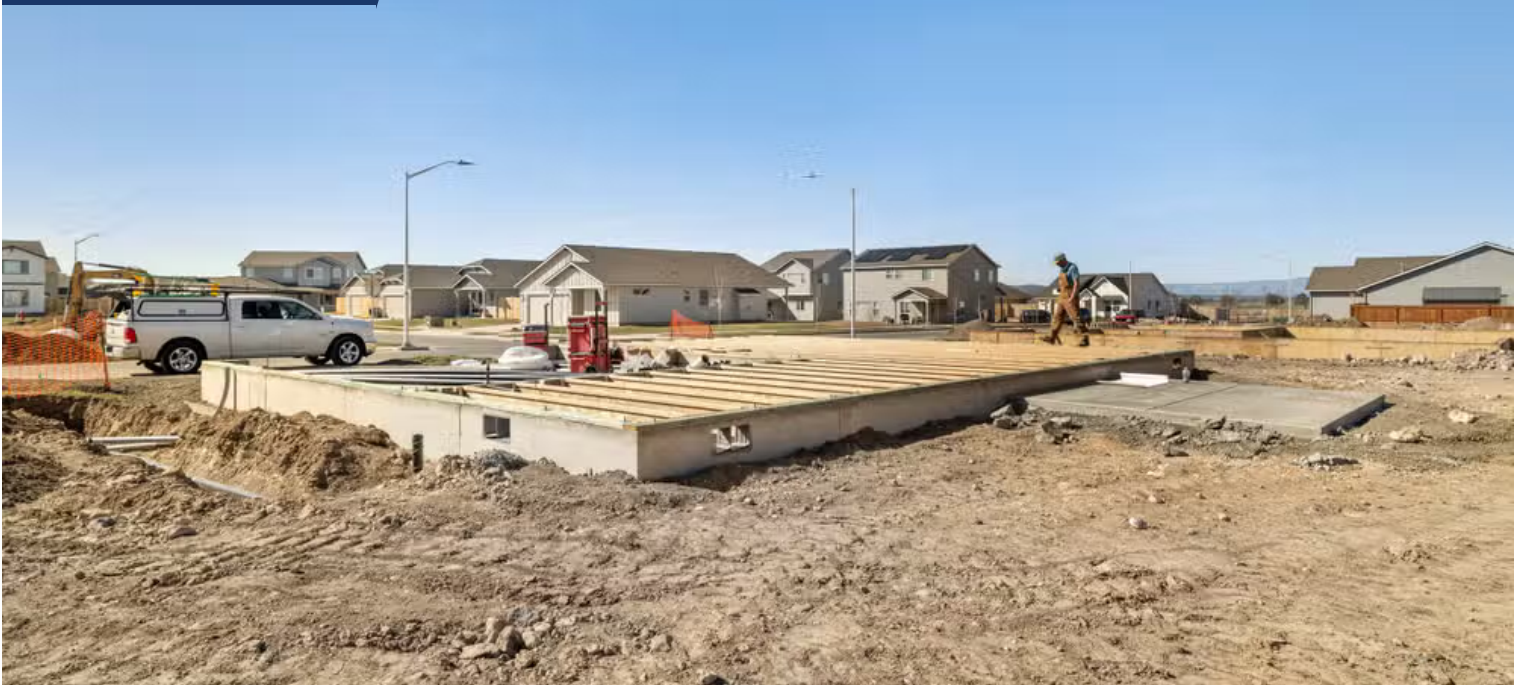
U - Craftsman