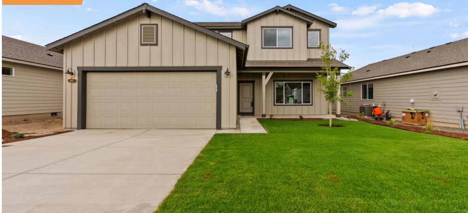
V - FARMHOUSE, 2 CAR