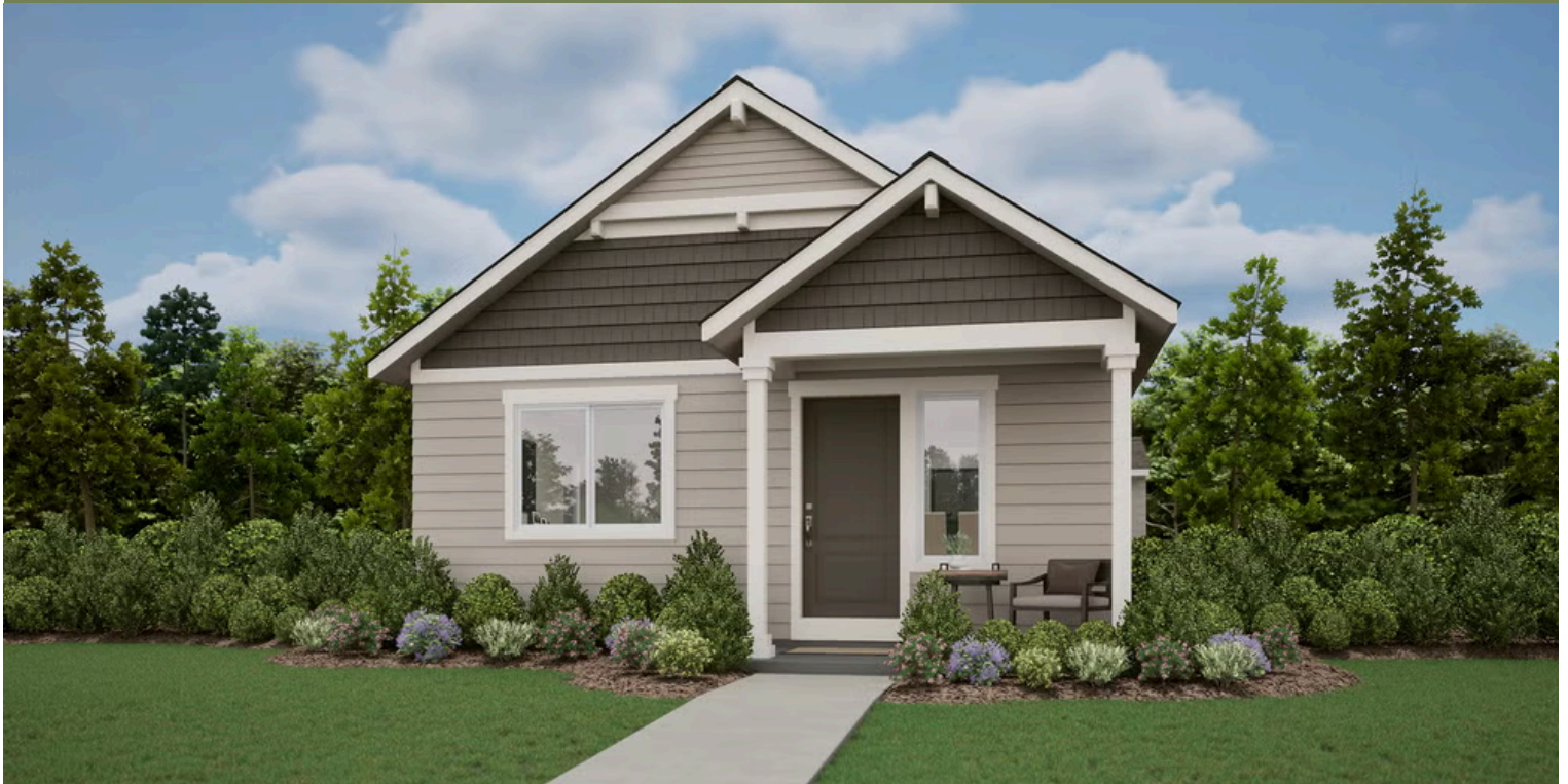
K - CRAFTSMAN ELEVATION