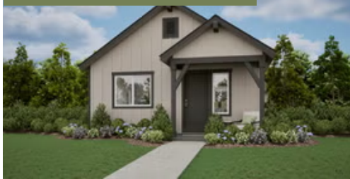
M - MODERN ELEVATION