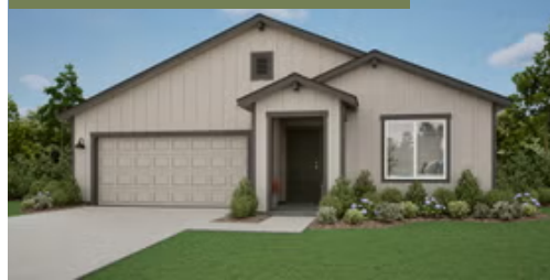
Z - FARMHOUSE ELEVATION