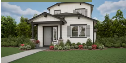
L - FARMHOUSE ELEVATION