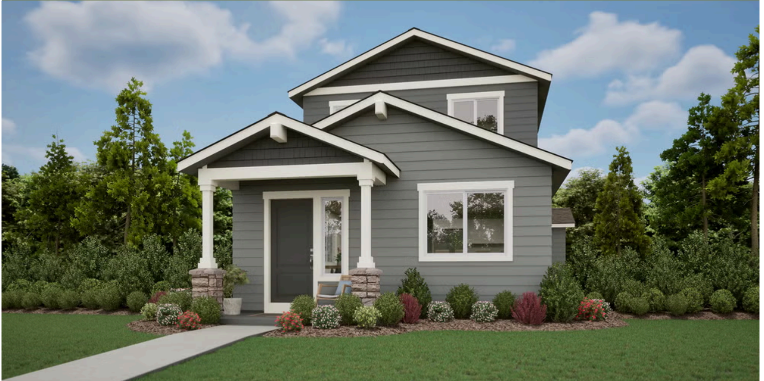
K - CRAFTSMAN ELEVATION