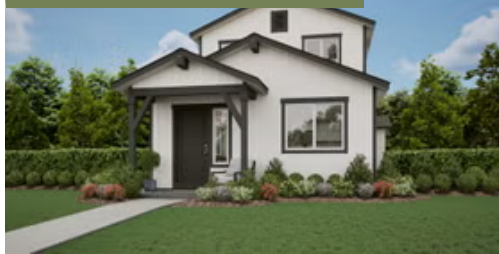
M - MODERN ELEVATION