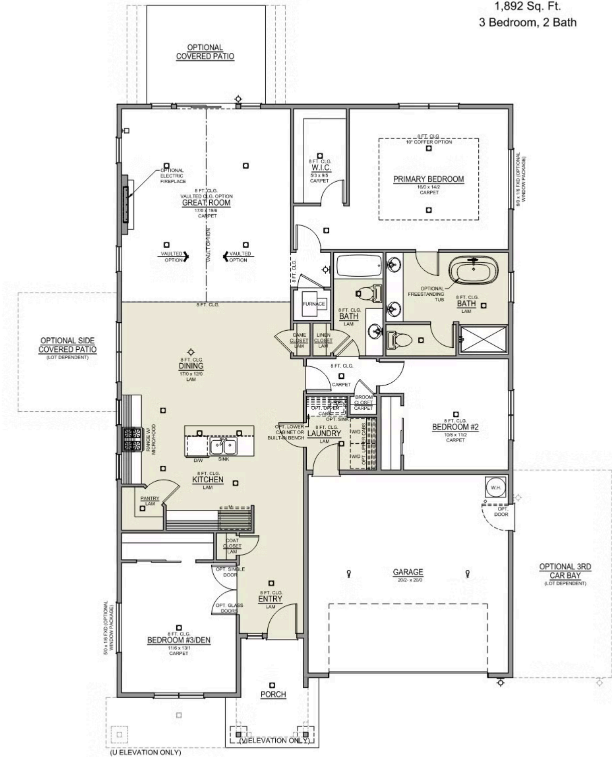
Charity 2-Car 1,892 Sq. Ft. 3 Bedroom, 2 Bath