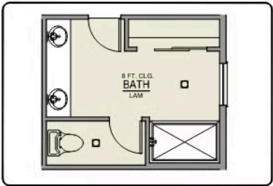
PRIMARY BATH LINEN CLOSET OPTION