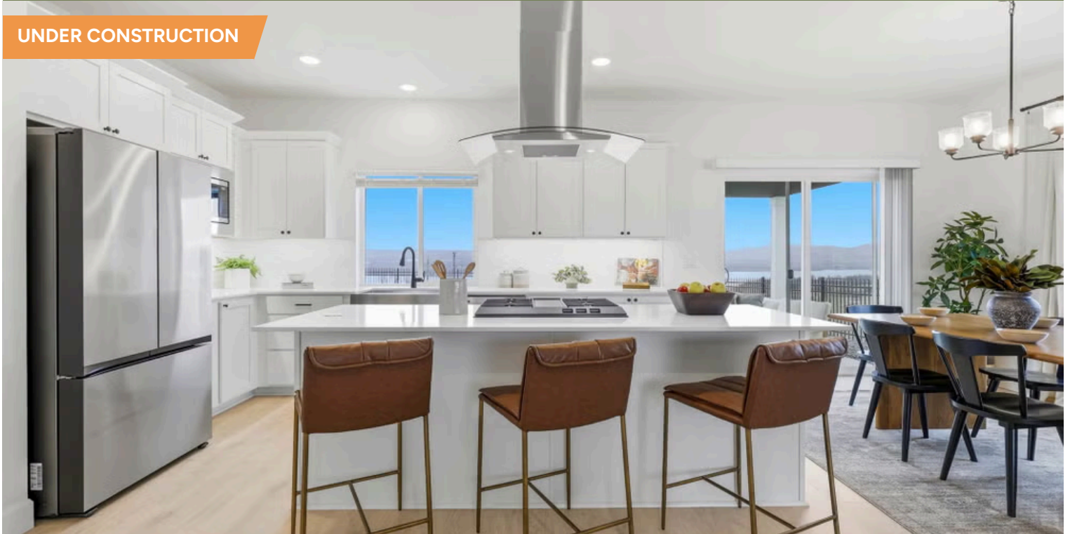
THIELSEN KITCHEN ISLAND WITH RANGE