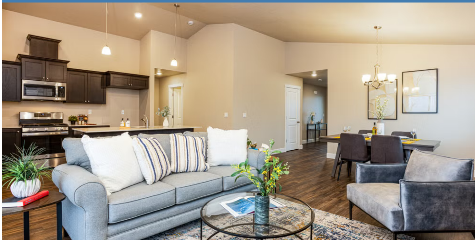
T - Traditional, 2 Car