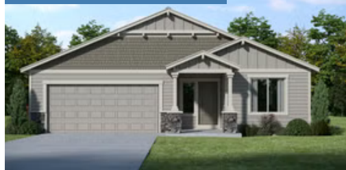
U - Craftsman, 2 Car