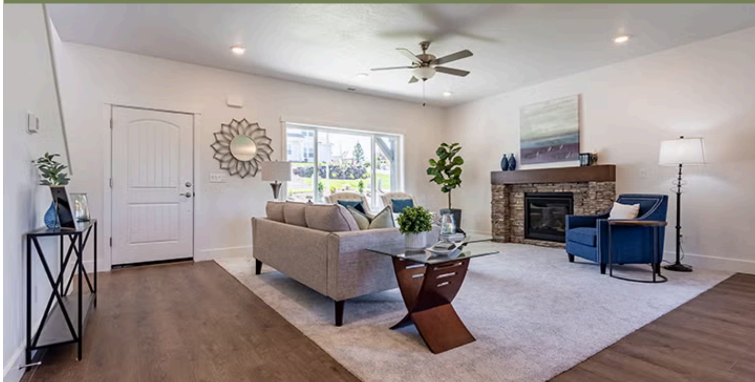
X - CRAFTSMAN