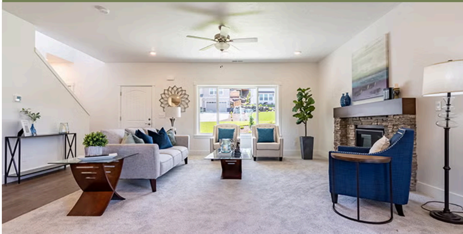
X - CRAFTSMAN