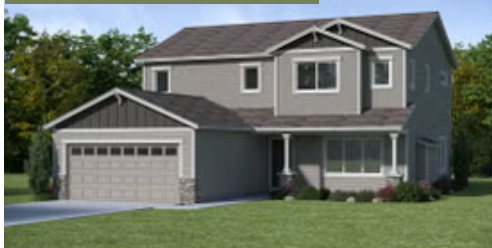
U - CRAFTSMAN, 2 CAR