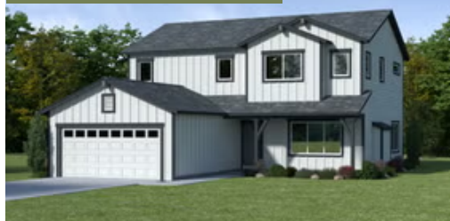
T - TRADITIONAL, 2 CAR