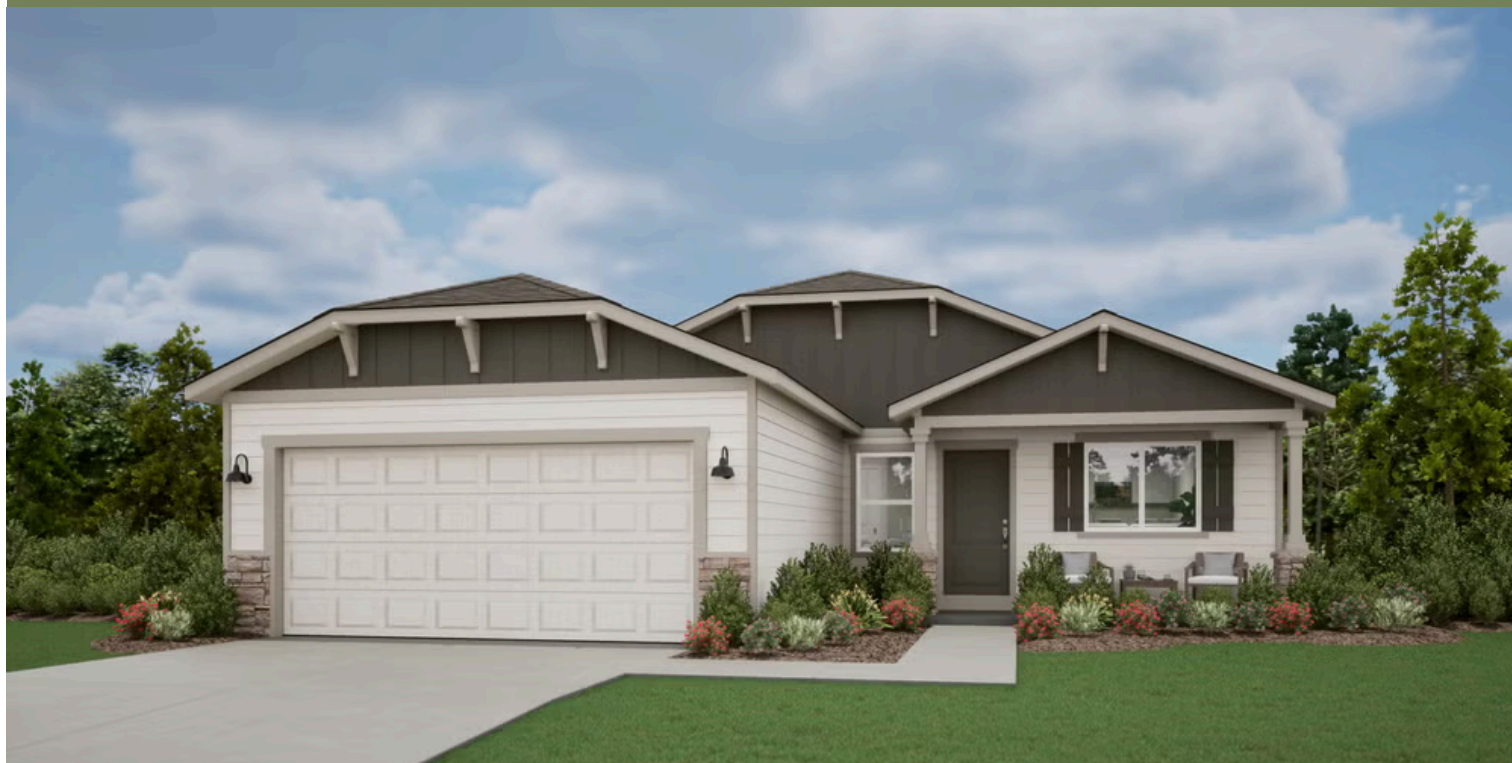
U - CRAFTSMAN